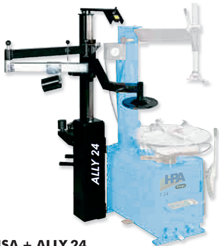
F 24 USA + ALLY 24

Other accessories are available upon request. For information, please consult our illustrated catalogue.